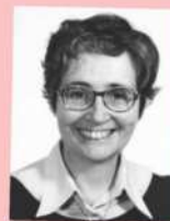
Maura Clarke, MM

The women martyrs of El Salvador December 2, 1980