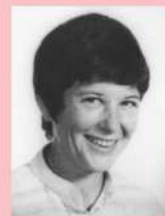
Ita Ford, MM