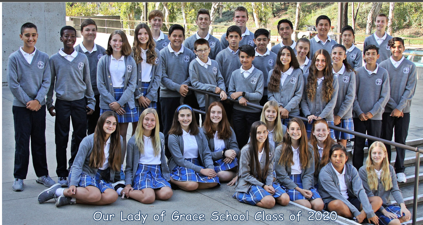
Our Lady of Grace School Class of 2020