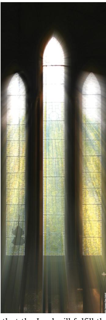
that the Lord will fulfill the promises of the prophet.

with us. Let us prepare our hearts and our minds for Christ's coming through prayer, confident